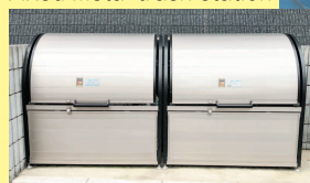
Fixed metal trash station