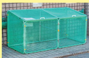
Collapsible Trash Station

Garbage stations are made of stainless steel, aluminum, and plastic to physically keep crows away from garbage. Choose the best one suits your purpose, such as a fixed or a collapsible type depending on where you need them, such as household, condominium, or neighborhood association.